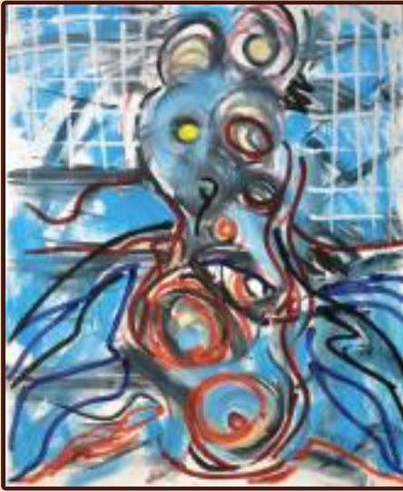
Goliath's Helm, 2015