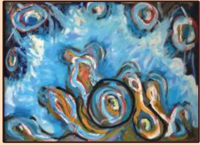
Stone garden, 2014