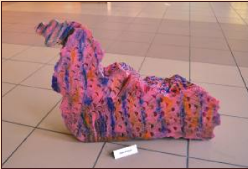
Bird from Kozienice – 2015