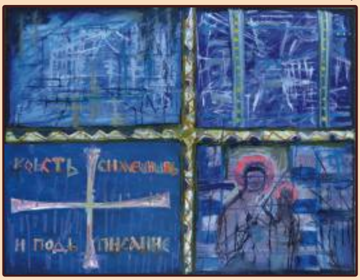
Prilipac dreaming – 2015