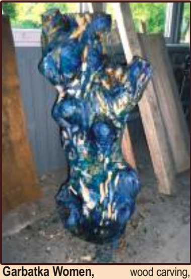
Garbatka Women, 2014