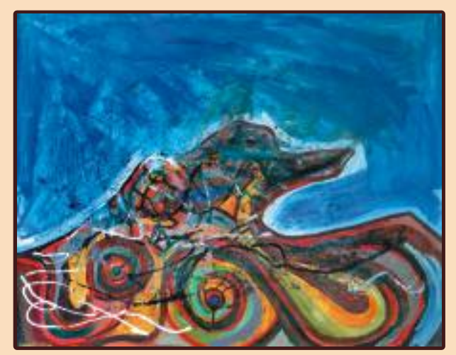
Moonlight Odyssey, 1997