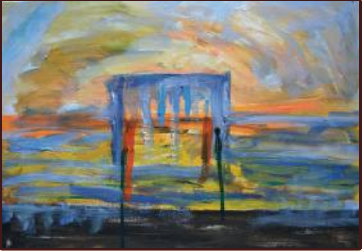
Moonlight Odyssey, 2015