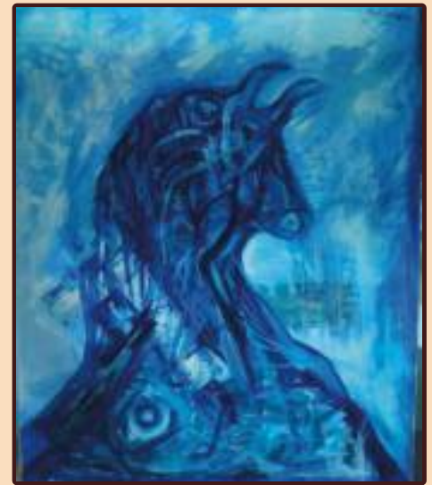
Wood carving oil, 60 x 45 cm