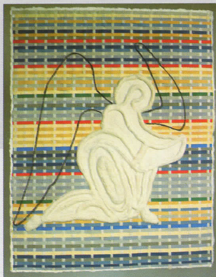
OHRID ANGEL XI, 1990 hand made paper (86x67cm)

The entire creative work of Simon Šemov, artist of specific painterly erudition, involves studying and analytical scrutiny of the very act of the game as an essential segment of life, in order to establish a synthesis of associative-symbolic painterly procedure in the bold resolution of the composition. These works are symbolically offered with religious passion for the game that includes a unity of rational and irrational issues whereas