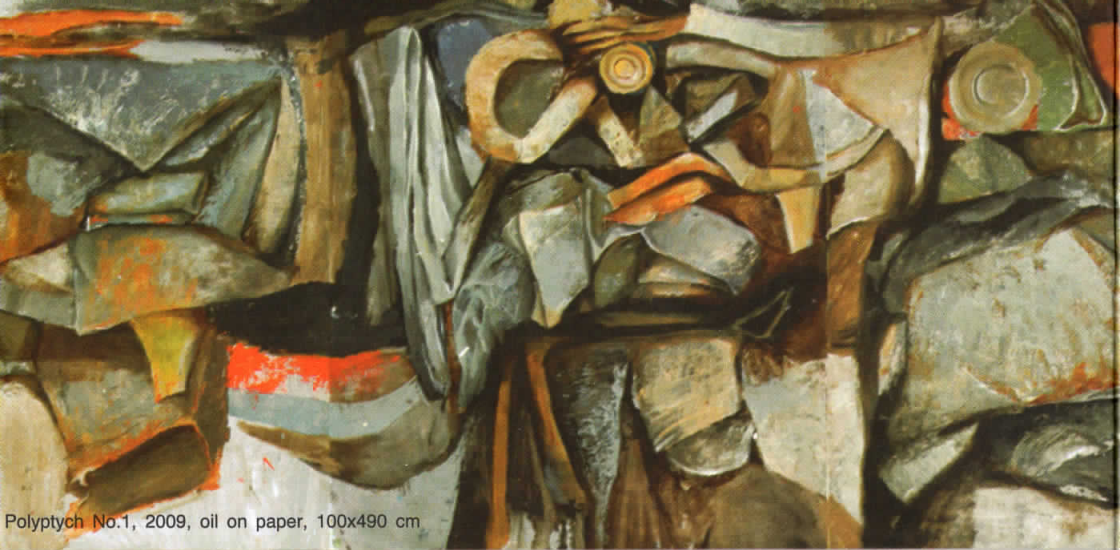
Polyptych No.1, 2009, oil on paper, 100x490 cm