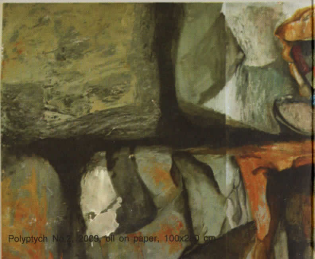
Polyptych No.2, 2009, oil on paper, 100x290 cm