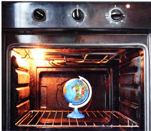
Dimitar Atanasov (Macedonia)

I always thought good photos were like good jokes. If you have to explain it, it just isn't that good.