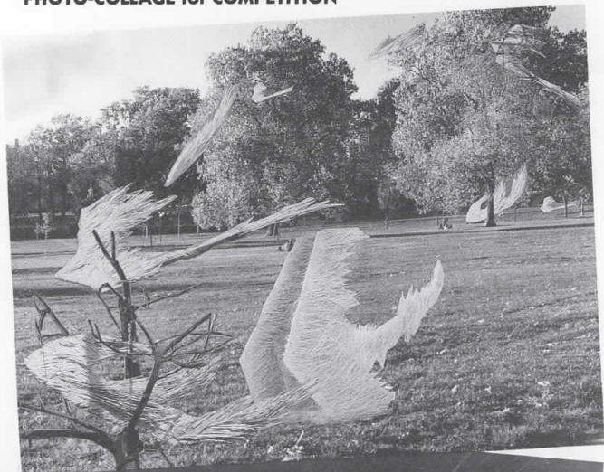
PHOTO-COLLAGAGE for COMPETITION