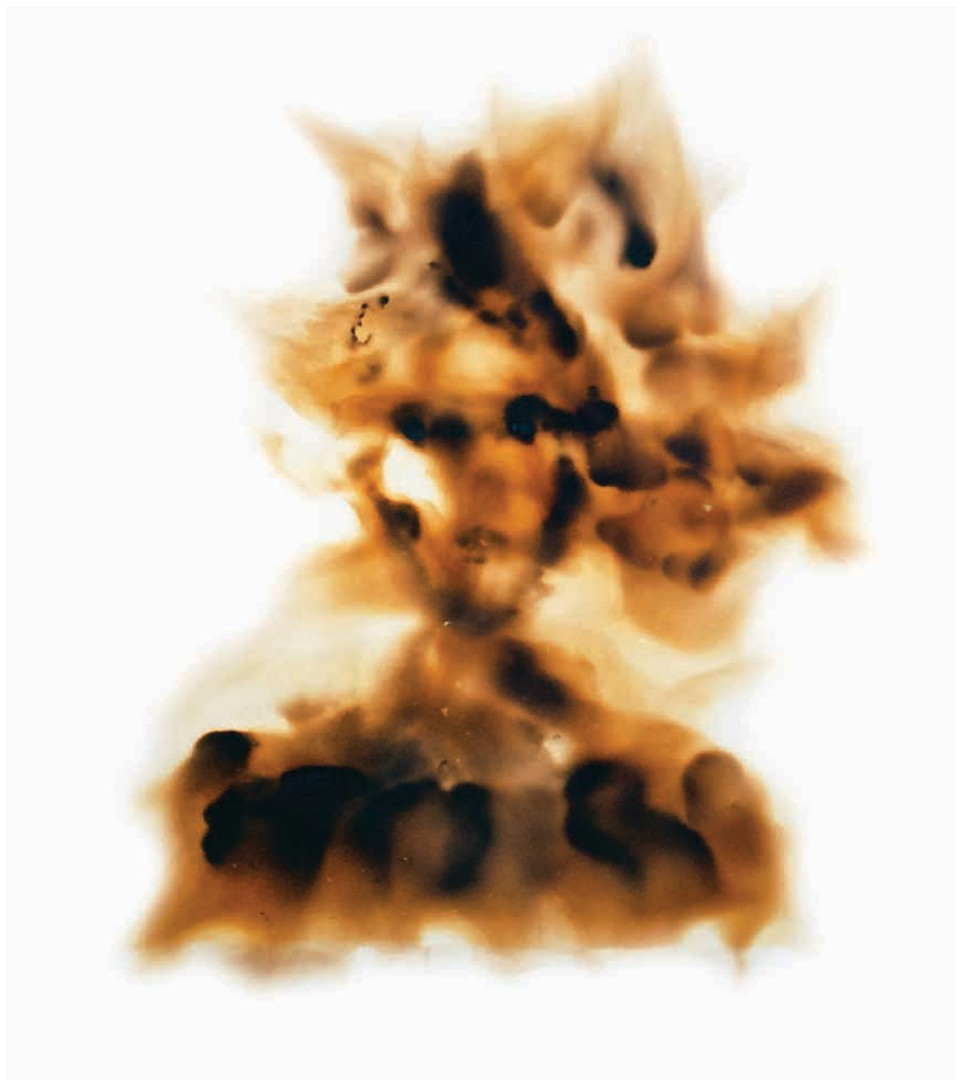
2014 - "Electric," Fire reflection on paper, 91x76cm (36x31in)