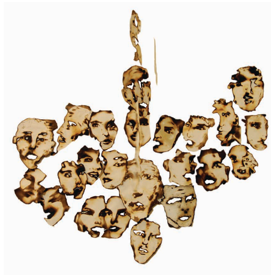
2014 Installation - Collecting memories, Yellowstone Art Museum, Billings, Montana