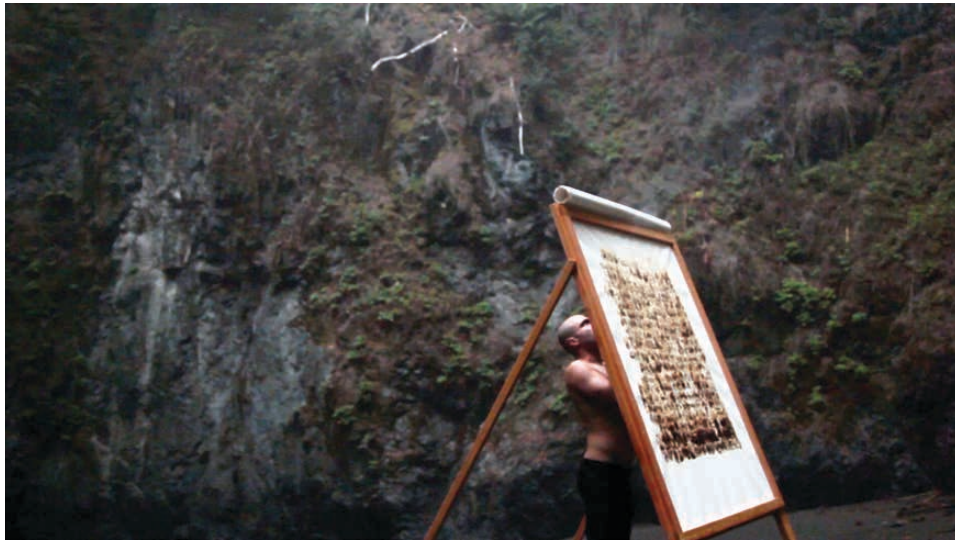
Above: 2015 - Wit-ness , performance, Fort Mason, California Below: Fall 2014 - Burning Words , Film Still

Wit-ness is a multi-media project grounded in performance art. It features film, photography and burned paper works. Developed from the theme of surveillance, Wit-ness includes an installation that represents the violent confrontation between identity and vulnerability, tied together by a narrative that addresses the concept of surveying and being surveyed.