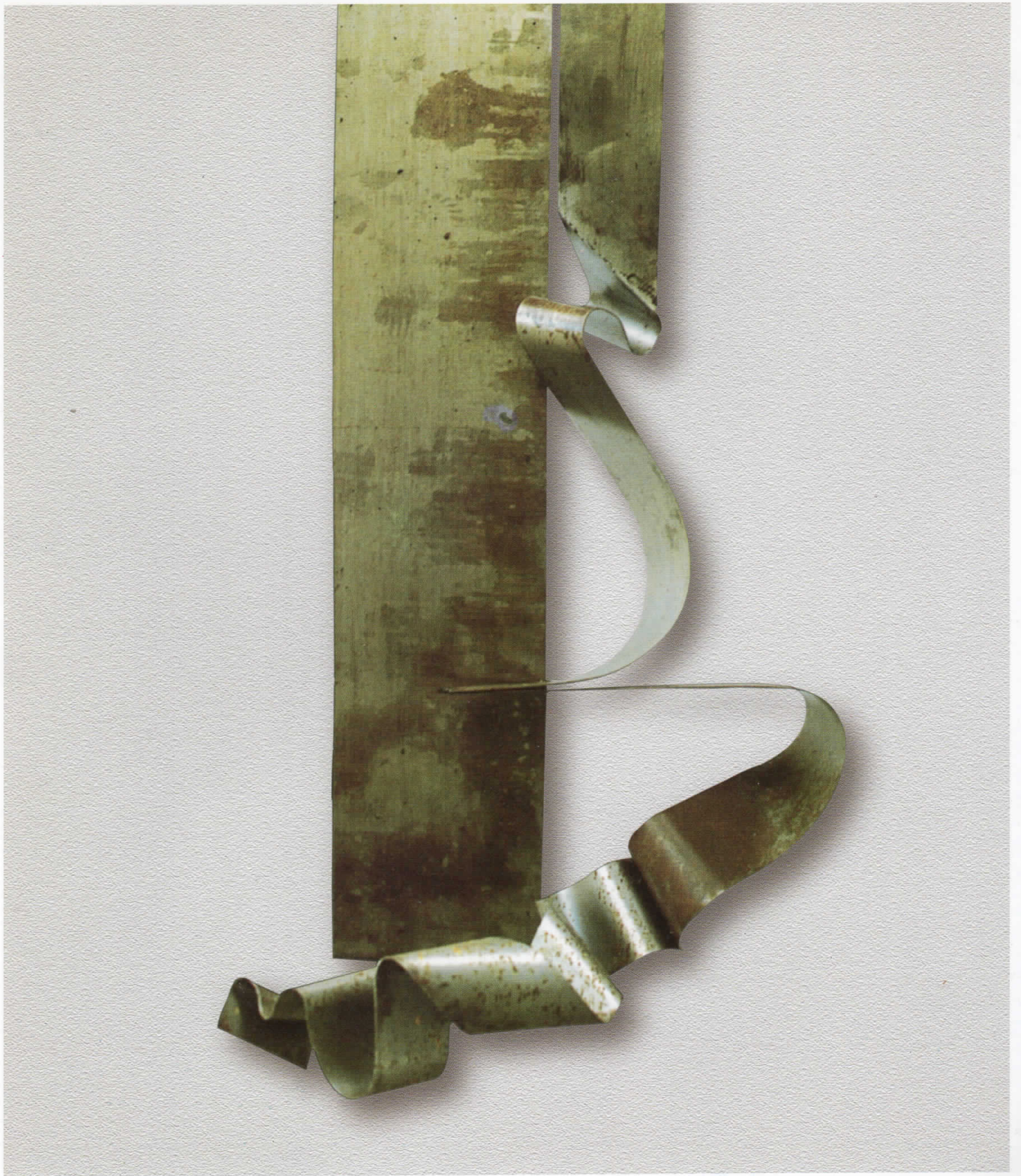
"Peace and Action", (detail), steel, 1996