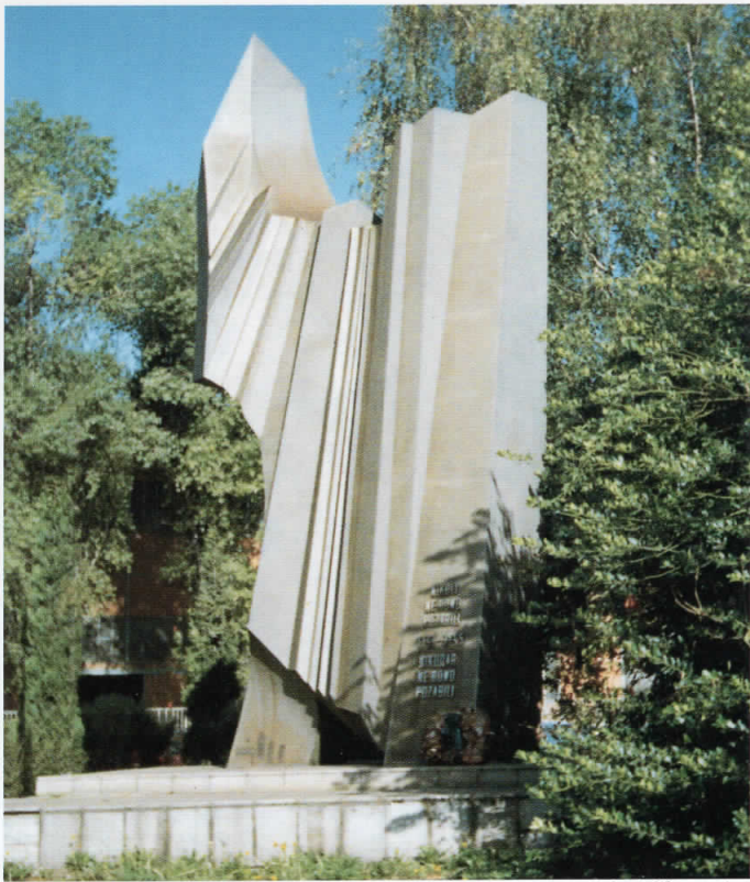
Monument for the Victim of the II World War in Koruska, Slovenia, rostfrai steel, 1977