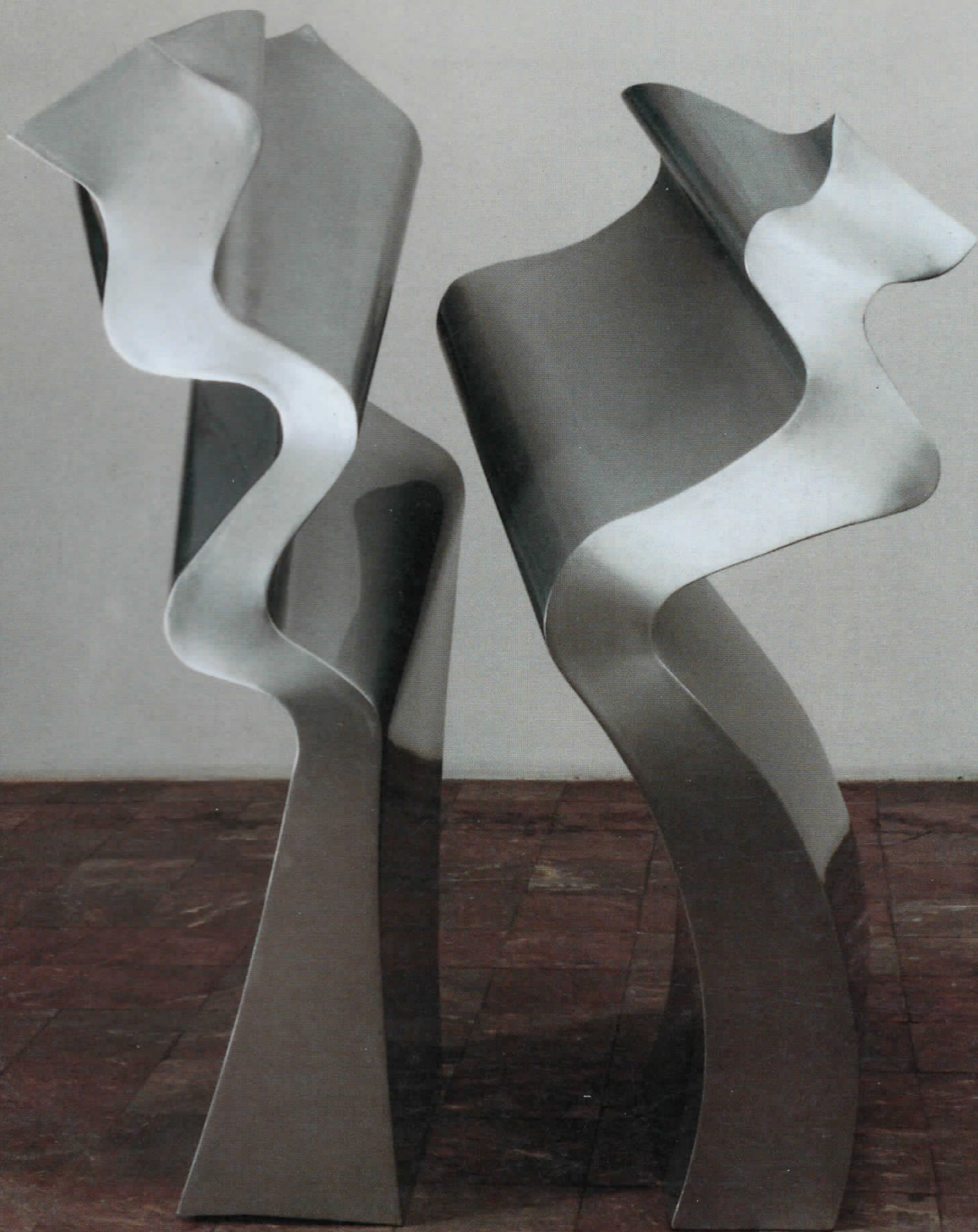
"Blooming", aluminium, 1997