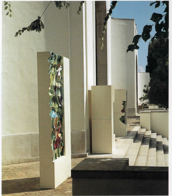
"Dialog", (detail), polyester, 1978, Venice Biennial Monument of St. Kliment Ohridski, black granit, 1972-1973, Skopje