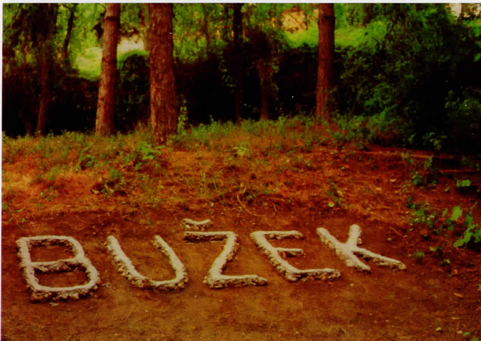
“BUŽEK“, concreted stone, 1997, 80x300 cm, backyard of the artist's studio, Vodno, Skopje, Macedonia